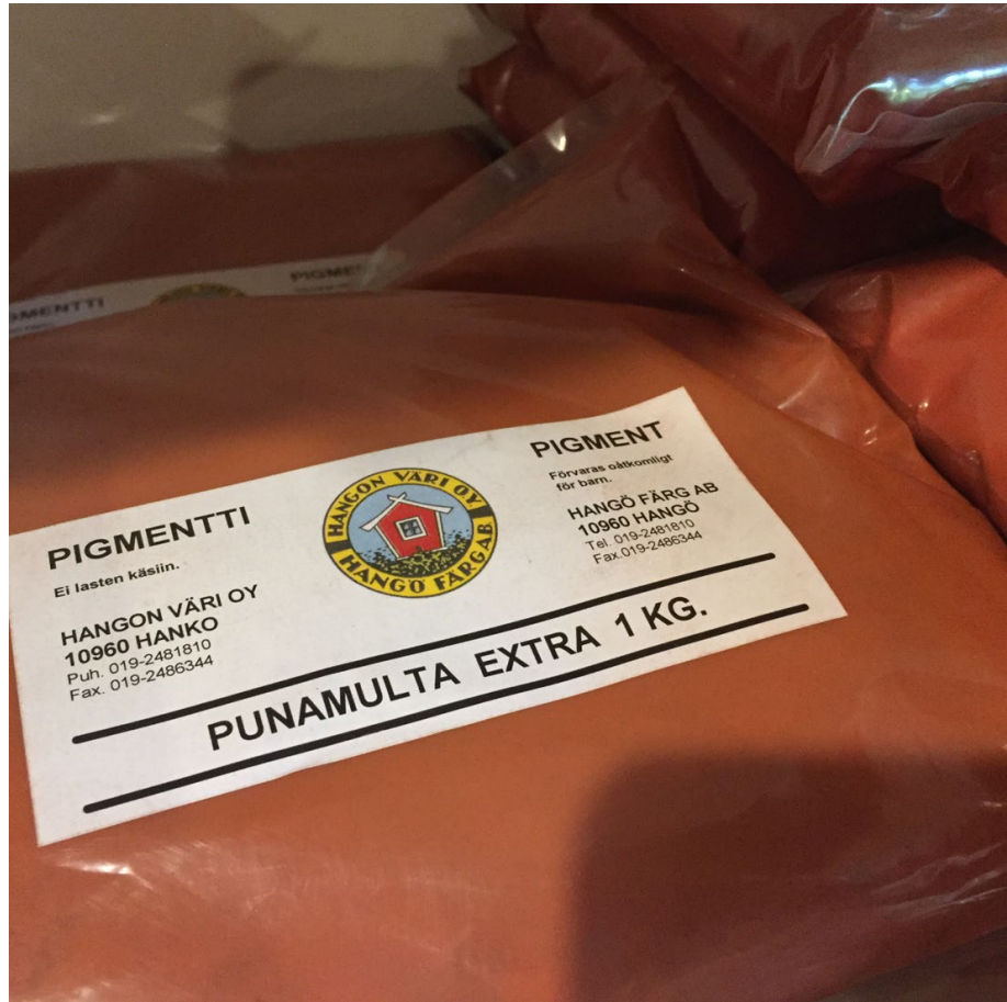
Red ochre = Ferrous clay soil – Natural color